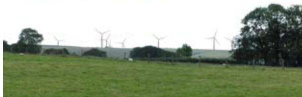
Photomontage of Blaengwen, taken from Brynawel Farm. Distance to nearest turbine is 2.9 km.

Force 9 Energy has received planning permission from Carmarthenshire County Council for its 10-turbine wind farm near Alltwalis and Pencader. This is the first planning application to be approved in Strategic Search Area G and puts Force 9 Energy at the forefront of wind farm development in this area which is encouraged by planning policy and supported by TAN8. The wind farm will have a maximum installed capacity of 30 MW. The original application for the wind farm had been with the Council since January 2005. The application was approved by the planning committee in August 2005 but surprisingly overturned by the Council's now disbanded Departures Committee pending the results of a study by Ove Arup to refine the Brechfa Forest Strategic Search Area. This study subsequently confirmed the Blaengwen site as being suitable technically and from a landscape and visual point of view and capable of making a significant contribution to the achievement of the Brechfa Forest capacity target of 90 MW by 2010. Work on the project is likely to start in the next 6 to 12 months with construction scheduled to be completed in 2008.