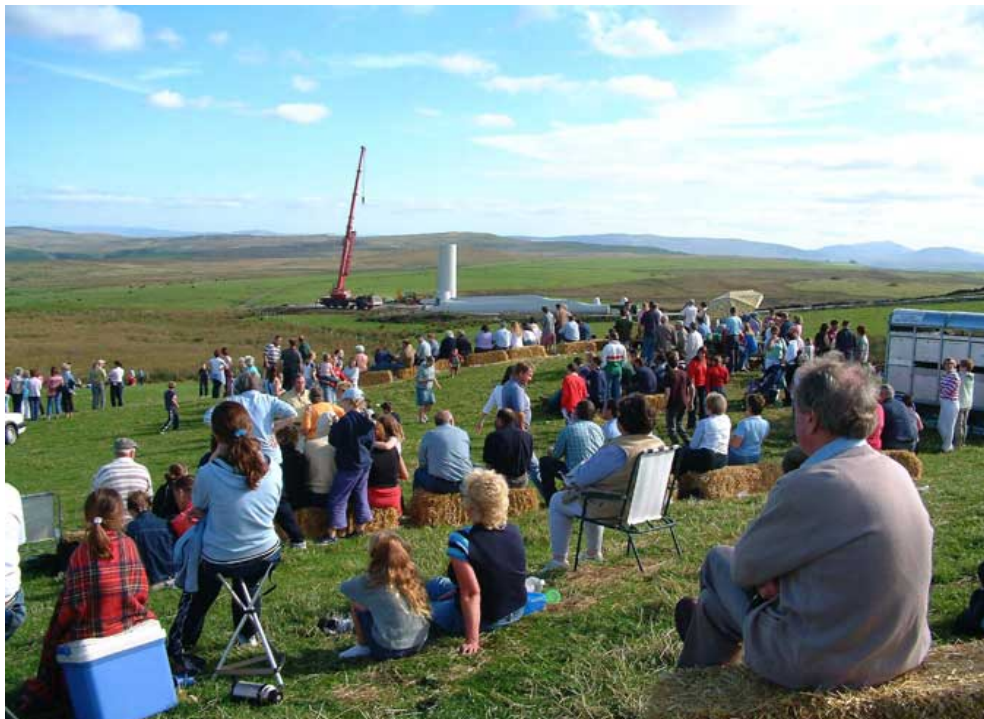
Locals gathering to watch the installation of the 1 st turbine at Moel Maelogan wind farm, Conwy, Wales