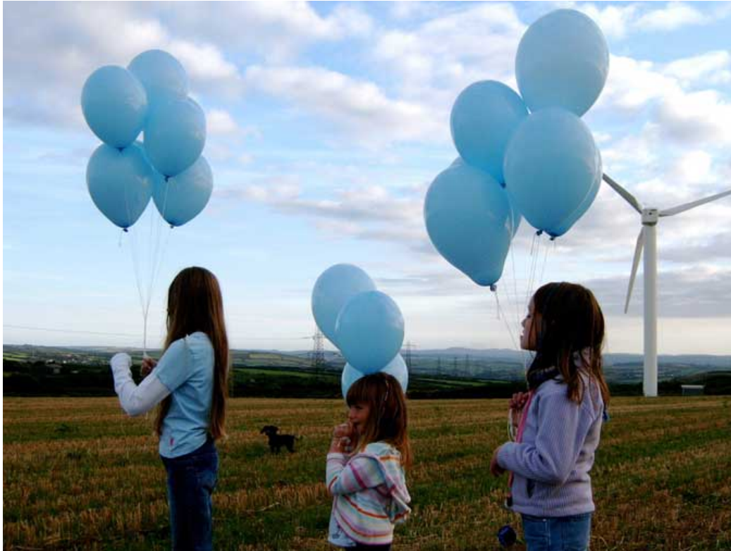
© Embrace the Revolution: celebrating Wind Weekend 2005 at Delabole in Cornwall