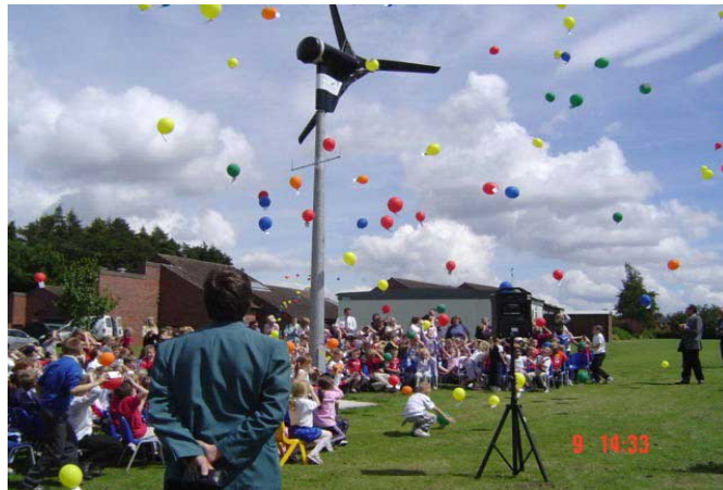
© Commissioning of wind turbine at Ladygrove Primary School 2005