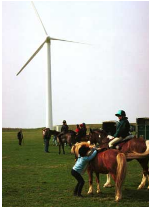
© Cumberland Foxhounds annual gymkhana at Siddick & Oldside wind farm, Cumbria