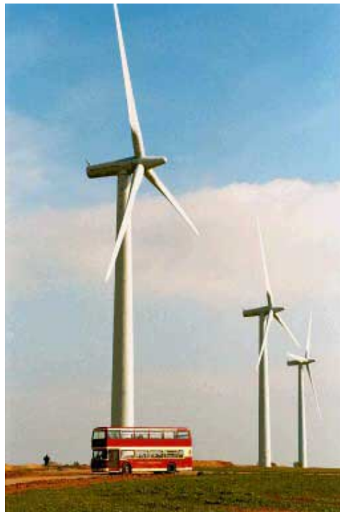
open day at Out Newton wind farm 2002