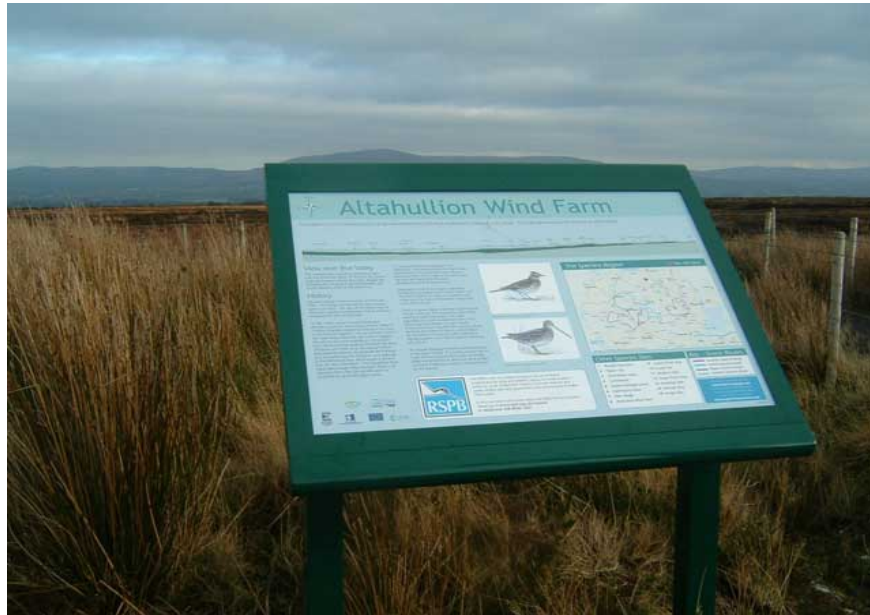
© Visitor information board at Altahullion Wind Farm