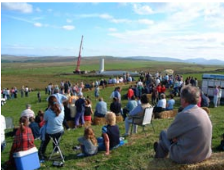
Moel Moelogan wind farm