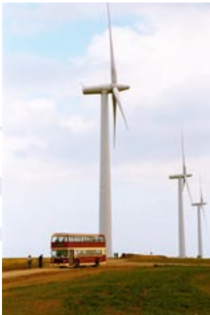
Out Newton wind farm

MRA (1992/93) Cemmaes Wind Farm - Sociological Impact Study, Market Research Associates for DTI. To establish attitudes of local residents to the wind farm at Cemmaes immediately after construction (phase one), and one year after (phase two) the wind farm became operational: