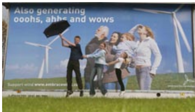
Embrace the Revolution billboard