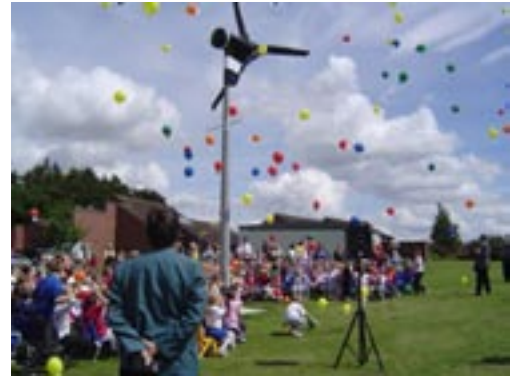
Ladygrove Primary School, Telford