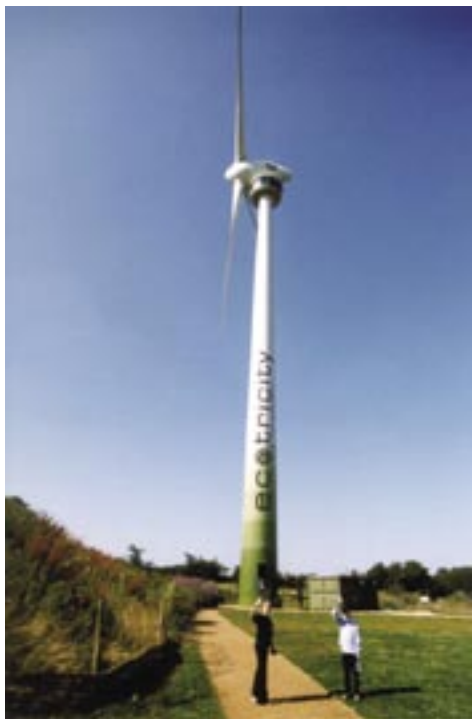
The Ecotech Centre, Swaffham

Some common features have been identified from the results of these surveys, notably that direct experience provokes a more positive attitude and that closer proximity results in a higher level of support. Similarly, where 'before and after' surveys have been conducted, there is typically a general shift in attitude towards the positive and that many fears of the potential impact of the development of the wind farm prove unfounded.