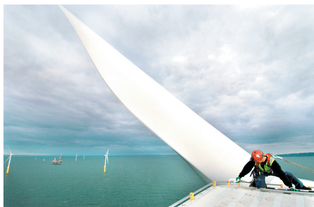
North Hoyle

Wind energy's key role in delivering the UK's renewables policy means that the sector is expected to supply three-quarters of the 10% by 2010 target, equivalent to some 8,000 megawatts (MW) of capacity. This is expected to be split roughly equally between developments onshore and offshore 4 .