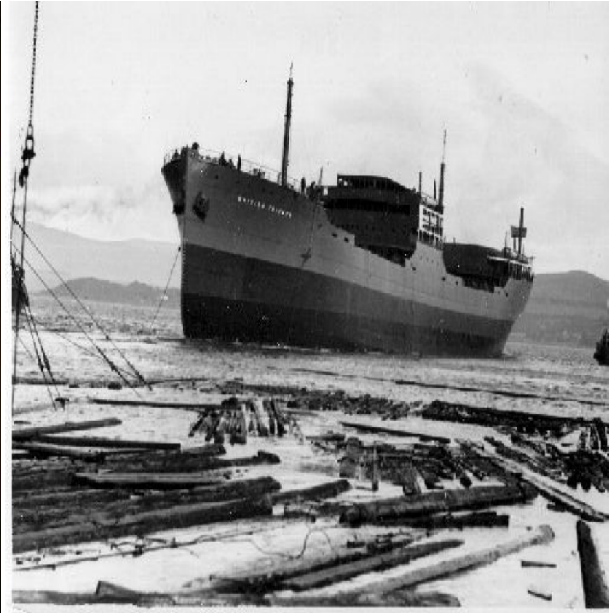
mv British Triumph